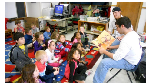
Science Fair & Peer Leadership Program