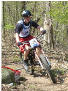
Mountain Bike Program