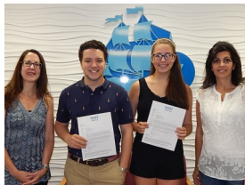
Senior Scholarship Award