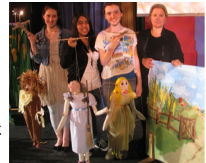
Wizards of Oz Show